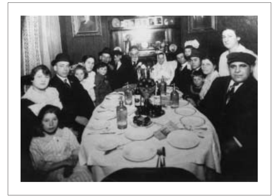
Family celebrations, such as the Passover Seder, are often a time when special foodways are prepared, traditional customs observed, and family stories told.

And never mind if the legends about them are romanticized, so that ancestors from Wales had a castle in the family and remote Irish ancestors were kings and queens and a slave ancestor was known to all his descendants as a proud rebel who won his own freedom.... Family legends are as much a part of our history as the true events out of which they grew and the real people around whom we have built our romances about the past.... If there are family movies — and many families have some stowed away — still photographs can be made from these that show wedding scenes and family reunions and picnics and children, who are now staid, middle-aged adults, turning somersaults on the lawn.