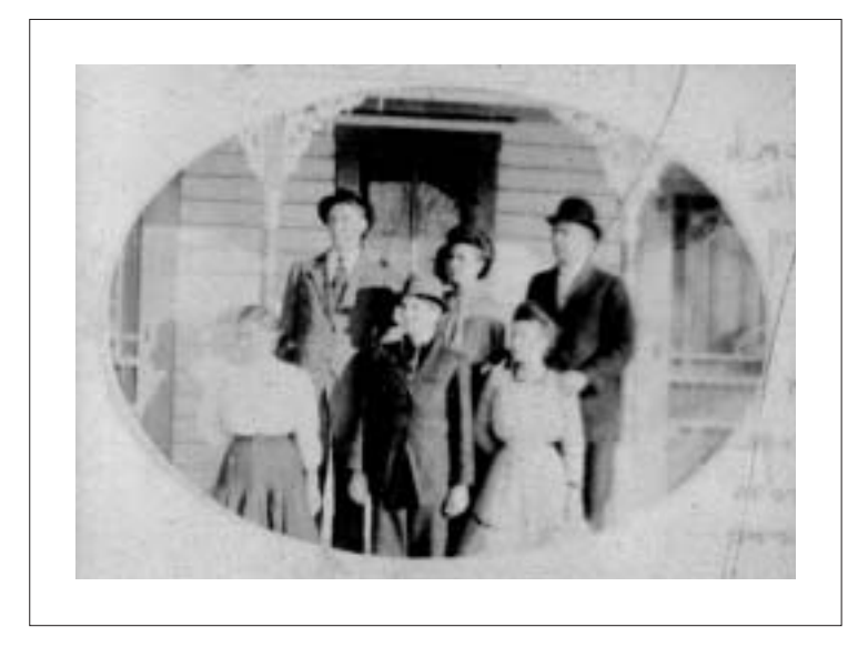
Family photos can evoke memories and trigger stories.